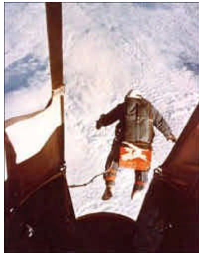
Project Excelsior at the Air Force Museum Captain Joseph Kittinger jumping from a balloon gondola at 102,800 ft. ((19.5mi or 31.3km).

In 1960 Air Force Captan Joseph Kittinger dived from a balloon that he had flown up to 31km altitude. He nearly reached supersonic speed before releasing his parachute. He was testing whether pilots of high altitude aircraft like the U2 spyplane could survive if they had to bail out.