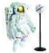
Astronauts at SpaceToys